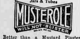
Better than a Mustard Plaster

Musterole does it. It is a clean, white ointment, made with oil of mustard. Gently rub it in. See how quickly the pain disappears. The Musterole for sore throat, bronchitis, tonsillitis, croup, stiff neck, asthma, neuralgia, headache, congestion, pleurisy, rheumatism, lumbago, pains and aches of the back or joints, sprains, sore muscles, bruises, chilblains, frost-bitten feet, colds of the chest (it may prevent pneumonia).