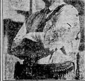
Has learned quick sure way to treat exposure rashes

Plans were announced for a membership drive which the local post is to stage in the near future.