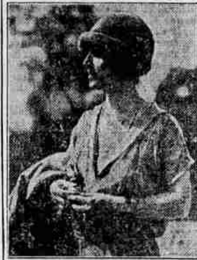
Relieved of pain in time to go to party