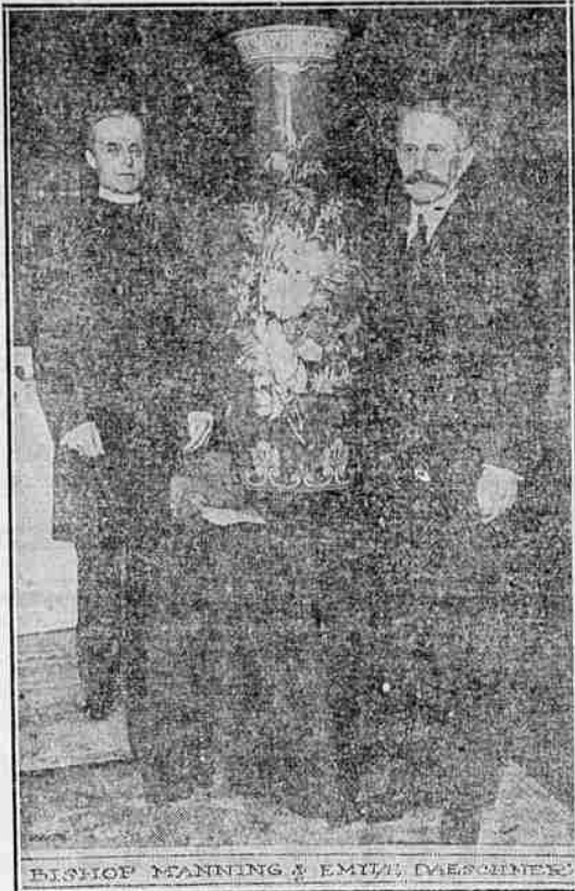
Ambassador Daeschner, on behalf of France, presented to Bishop Manning this Sevres vase as a gift for the Cathedral of St. John the Divine in New York. It was made at the Government factory in Sevres and sent by Aristides Briand.