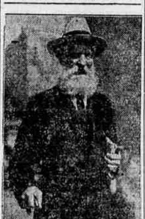
Suffered with rheumatism for years