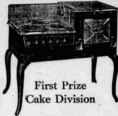
First Prize Cake Division