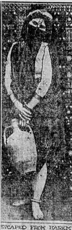
ESCAPED FROM HAREM

From the sands of the desert this girl was taken to the harem of Mohammed V, from which she escaped when he was deposed in Constantinople. Since then she has been posing as a model in the Turkish capital.