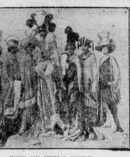
KING'S 1925 MUSICAL COMEDY