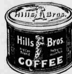
In the original Vacuum Pack which keeps the coffee fresh.