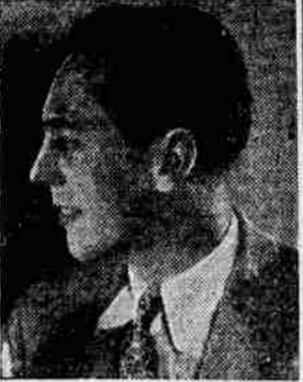
—the idea was new to him

HE had eaten a few Life Savers before lighting a fresh smoke. And he offered his friend some.