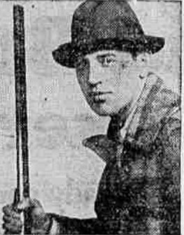
Relieved of lame back overnight