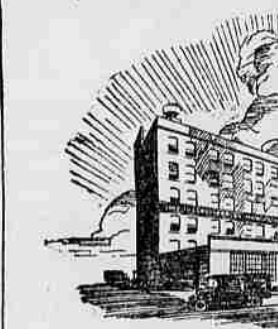
Golden West Coffee

The new building of three stories is the tallest in Tel Aviv. In addition to the banking quarters it will contain commodious club-rooms for the entertainment of patrons and tourists. It also will have a roof garden, from which a fine view of the Mediterranean sea and the hills of Judea may be had.