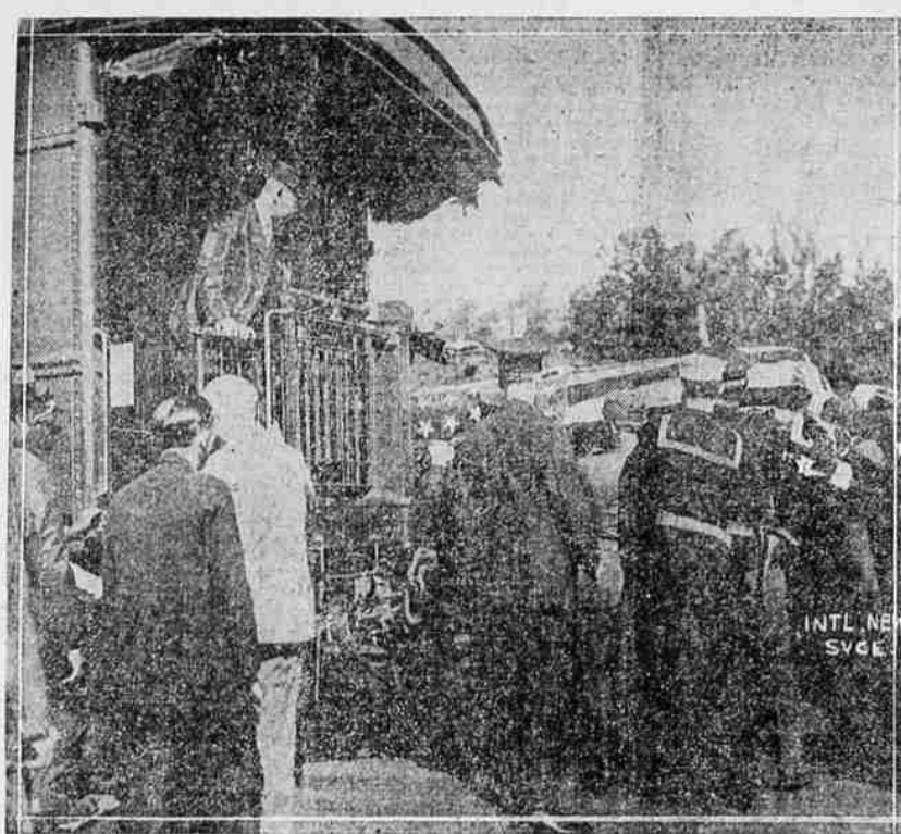
The military guard of honor placing the casket containing the last remains of "The Commoner," William Jennings Bryan, into the car which bore them from Dayton, Tenn., scene of the famous Scopes evolution case, to the national Capitol at Washington, D. C. Burial will be at Arlington National Cemetery.