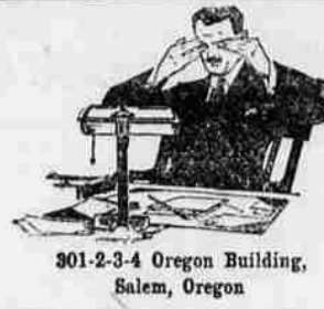
301-2-3-4 Oregon Building, Salem, Oregon