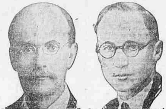
Left: DR. HARVEY W. WILEY & BRIG. GEN. J. L. HINES Center: PROF. GEORGE G. MURRAY & PROF. J. T. SCOPES

Dr. Harvey W. Wiley, known as "Father of the Pure Food Law," protested to President Coolidge that the act is being widely disobeyed. Major General John L. Hines, chief of staff, summarizing the Hawaiian navy maneuvers, said he was convinced Hawaii could be taken unless its defenses were increased. Professor George Gilbert Murray, Oxford University, characterized the prosecution of Professor J. T. Scopes in Tennessee for teaching evolution in classes "the most serious setback to civilization in all history."