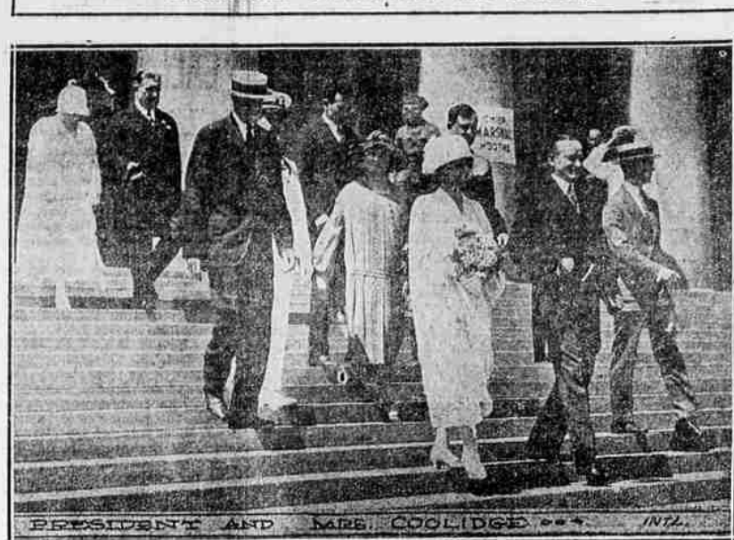
President and Mrs. Coolidge are shown leaving the Technology Building at Cambridge, Mass., after witnessing an impressive pageant commemorating the 150th anniversary of Washington's acceptance of the command of the revolutionary army.