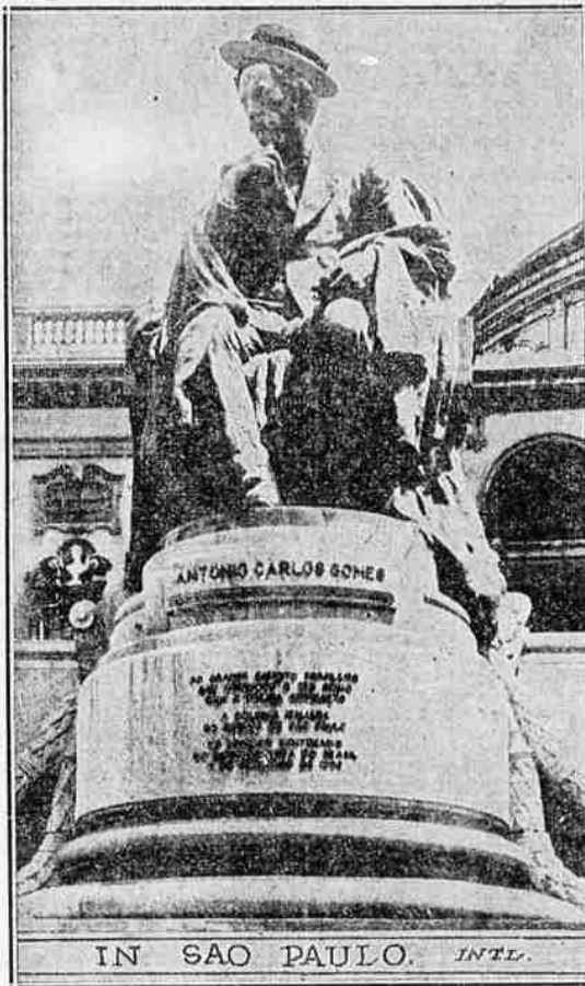
IN SAO PAULO, INTL.

When the citizenry of Sao Paulo, Brazil, awoke one summer morning to find every statue in the city sporting the latest model straw hat, intense indignation followed. The proprietor of a chain hat store did a rushing business, nevertheless. This is how the statue of Carlos Gomes, noted composer, looked.