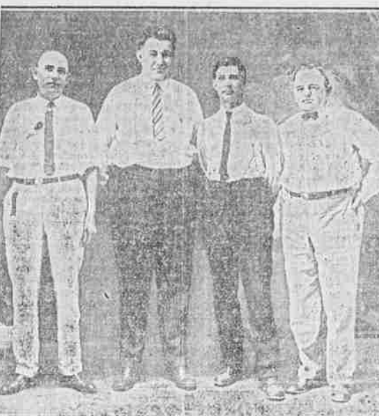
DAYTON, TENN. RECEPTION COMMITTEE.