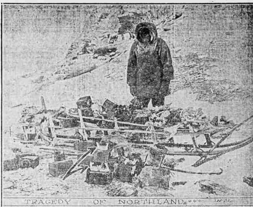
Scattered heaps of bones, rotting clothes and equipment and a pile of rusted and empty food tins were found by the H. A. Snow expedition, which sought out the remains of the party which started to walk to the mainland after the Stefansson ship Karluk was crushed in ice near Herald Island in 1914. Arrows show three jawbones.