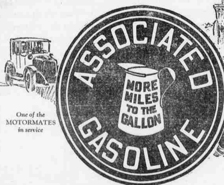
One of the MOTORMATES in service