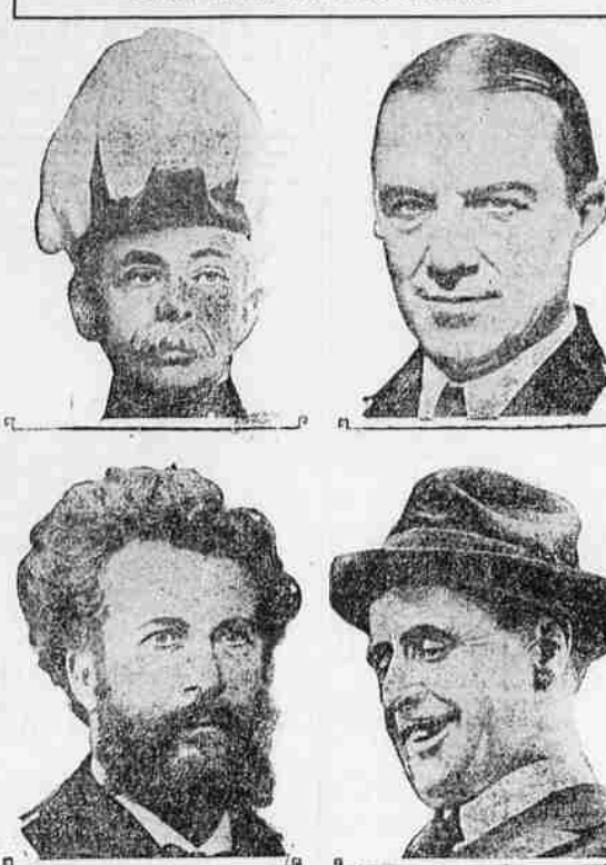
Left: FIELD MARCHAL LORD PLUMER; OWEN D. YOUNG. Below: CAMILLE FLAMMARION & DONALD MACMILLAN

Field Marshal Lord Plumer, known as Britain's "Soldier's Soldier," has been named new High Commissioner for Palestine, a step foretold by a former hand in the East. Owen D. Young co-author of the Dawes Plan, was given the honorary degree of doctor of laws at Columbia University's commencement. Camille Flammarion, noted French astronomer and poet, died in his observatory in France at the age of eighty-three. Donald B. MacMillan, American explorer, may head a relief flying expedition to search for the missing Amundsen-Ellsworth Polar expedition.