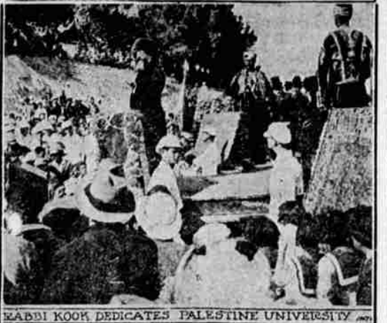
RABBI KOOK DEDICATES PALESTINE UNIVERSITY

The first Jewish University in Palestine was dedicated recently with impressive ceremonies. Leaders of the Zionist movement throughout the world attended the dedication. The photo shows a general view of the ceremonies at Mount Scopus, Palestine, the Grand Rabbi of Palestine, Dr. Abraham Isaac Kook, delivering the principal address.