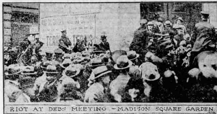
RIOT AT DEBS MEETING - MADISON SQUARE GARDEN

Mounted police rode into a crowd of 10,000 persons who stormed the doors of Madison Square Garden, New York, into which 15,000 others had already fought their way to hear Eugene V. Debs, former radical prisoner, defeated Socialist candidate for President, and citizen of Terre Haute, Ind., who spoke at the debut of the Workmen's Circle National Convention. Several women were hurt and one woman was trampled by a horse.