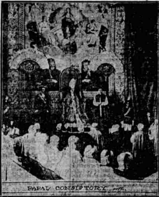
An impressive ceremony attended the proclamation by Pope Pius XI of the canonization and beatification for the Holy Year of 1925 in Rome. Photo shows the consistory in the Vatican.