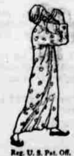
Reg. U. S. Pat. Off.