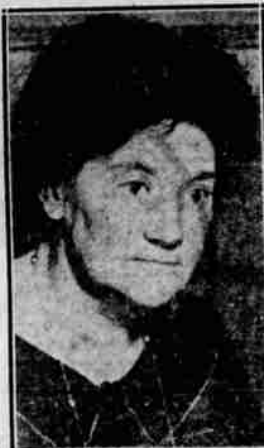
Mrs. MARY MACSWINEY

A hunger strike, similar to the one which her brother, Terence died, was threatened by Mrs. Mary MacSwiney in Chicago, when Federal officials led her to believe she might be arrested for coming into the country without a passport. She was on a patriotic mission for her cause.