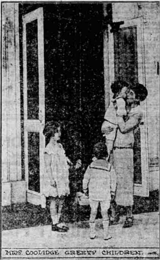
MRS. COOLIDGE GREETING CHILDREN.

A kiss for each was the reward Mrs. Calvin Coolidge bestowed on three youngsters who carried a basket of flowers to the White House out of gratitude for President Coolidge's action in proclaiming May Day as "National Child Health Day."