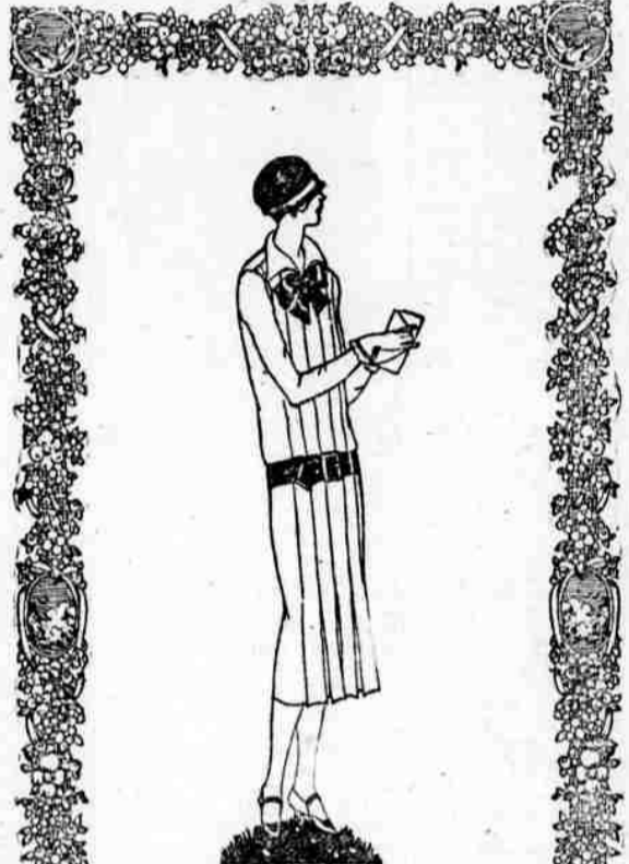
Linen Frocks $3.50

—Frocks of pure linen in the season's newest modes at the small price of $3.50. In blue, peach, apricot, lavender green, sunshine yellow and many others. Regularly $5.95.