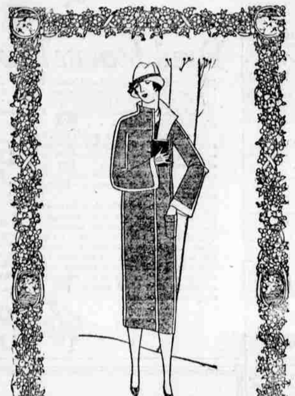
New Coats $15.00

—These are new! Direct from New York City. Latest shades of tan, newest trimmings, linings, etc. It will pay you to shop for these soon, they are exceptional in value.