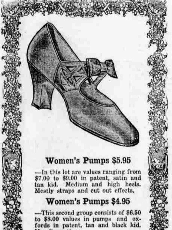
Women's Pumps $5.95

—In this lot are values ranging from $7.00 to $9.00 in patent, satin and tan kid. Medium and high heels. Mosty straps and cut out effects.