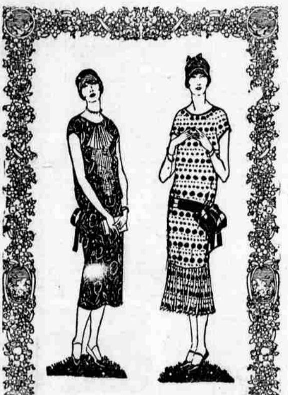
Printed Frocks $15.50

—Printed Crepes and radiums in gaily colored designs and delicate pastel shades. This is a season of printed frocks, and these are quite the loveliest that have appeared in many a season.