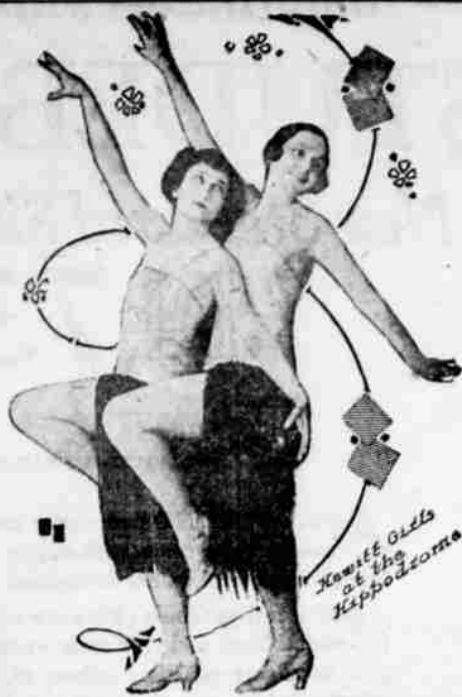
Newest Girls at the Hippodrome