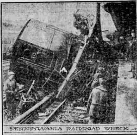
PENNSYLVANIA RAILROAD WRECK.

Two railroad inspectors and a negro chef were killed, and forty passengers injured when a Philadelphia bound local of the Pennsylvania Railroad crashed into the rear end of a Palm Beach flter standing at Manhattan Transfer, near Newark, N. J. Faulty brakes were blamed for the accident. Most of the injured were passengers breakfasting in the dining car at the rear of the stationary train.