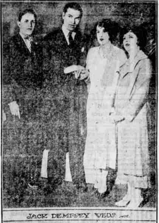
JACK DEMPSEY WEDS WIFE