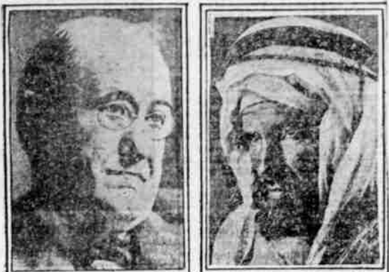
Shirley Booth & Ivy St. Clair Below: William A. Brady & Abdel-Krim