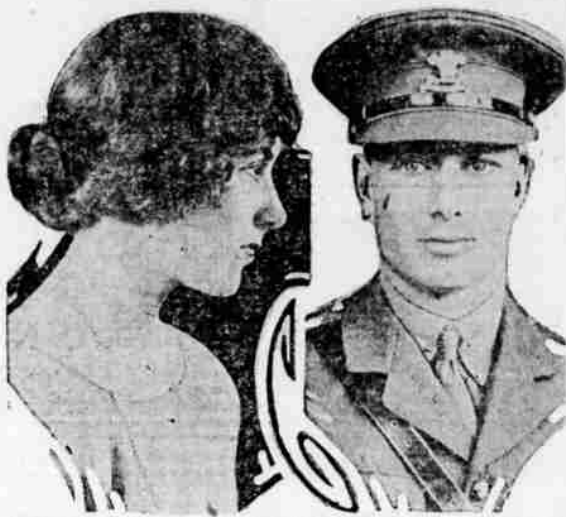
LADY MARY SCOTT & PRINCE HENRY

The engagement of Prince Henry, the military member of the British royal family, to Lady Mary Scott, second daughter of the Duke and Duchess of Buccleuch, is daily expected by London society. Lady Mary, though only twenty, is said to possess an aristocratic dignity worthy of a royal match.