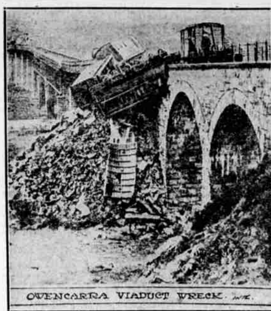
OVENCARRA VIADUCT WRECK

While crossing a trestle over a deep and wide ravine in Douglas, Ireland, a train was blown off the rails and several of the cars fell forty feet to the bottom of the valley, causing the deaths of four persons and serious injury to nine others. The victims lay for hours in the storm before help reached them. Photo shows the wreck of the train and the debris from the shattered Ovencarra Viaduct which piled down on the passengers.