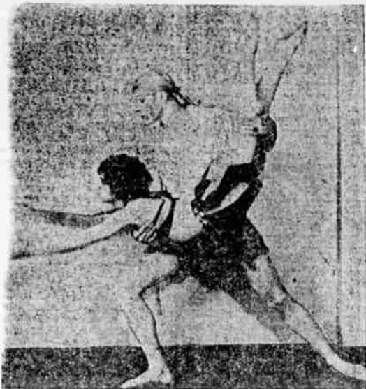
Two of the dancers who will appear at the Grand theater February 13 under the sponsorship of the Civic Music club.