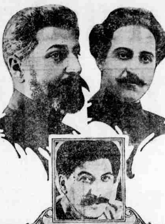
MAMEN ORAKHELASHVILI, SIRGO ORDSHENEKIDZE of (Russia) M. STALIN

A new power has arisen in Trans-Caucasia, a power which many political observers believe may become ruler of all the Russia. It is the Republic of Georgia, able leaders, drafted from the ranks of the disaffected in the Soviet regime, are making of this new State a potent factor in government. Mamien Orakhelashvili is President of Georgia. M. Stalin, one of the ablest of Russia's leaders, has joined in the formation of the new government. Sirgo Ordshekenidze is commander of the Georgian army.