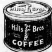
In the original Vacuum Pack which keeps the coffee fresh.