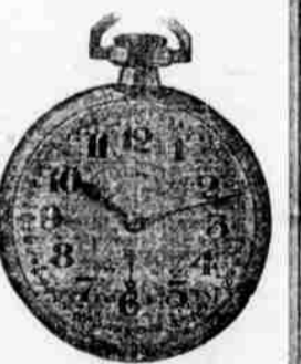
The Bunn Special $57.50 DELIVERED FOR A DOLLAR

The B. W. Raymond watch is Elgin's finest time-piece for railway men. It has 21 jewels and is guaranteed. It will pass inspection on any railroad in the United States. Its outstanding feature is the new non-pull-out stem and the dust and water proof case. Nationally priced at $55.00. Here at the lowest cash price, but—