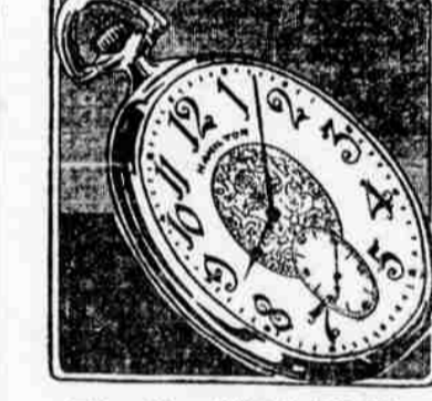
Hamilton Watch $39.50 DELIVERED FOR A DOLLAR

Here are all the best watches—and you may buy one without even missing the money. The price you pay is no more than a fair one. Nothing is added for the privilege and convenience of "paying as you are paid." Indeed, you will find that because we buy and sell more, we are enabled to sell for a little less—a little less than the jeweler who operates but one store.