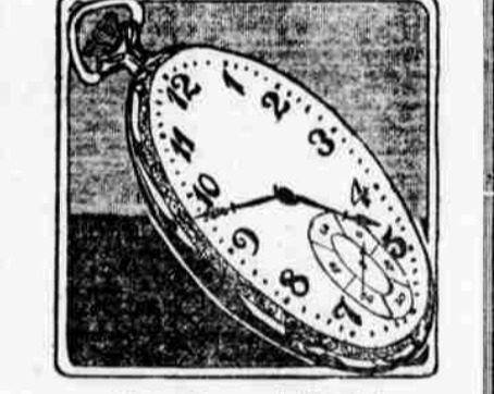
The Howard Watch DELIVERED FOR A DOLLAR

The Hamilton watch is known the country over and the price of $39.50 is the lowest at which genuine Hamiltons can be sold—even if one pays spot cash. Fully guaranteed. Priced at $39.50.