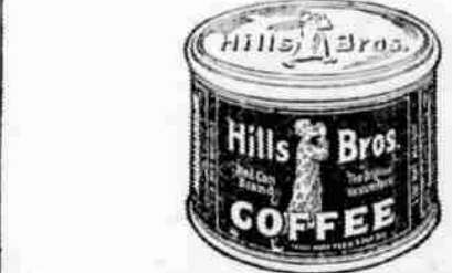
In the original Vacuum Pack which keeps the coffee fresh.