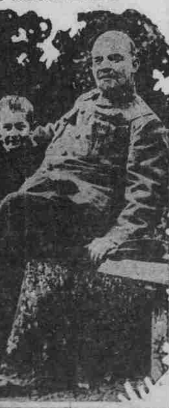
Nicolai Lenin, wife and children, is shown in Moscow, where he is recovering from his recent critical illness.