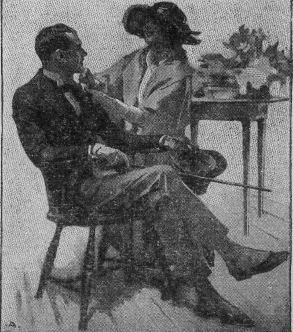
Copyright 1922 Hart Schaffner & Marx