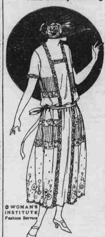
By MARY BROOKS PICKEN

The popularity of the square neck line is made more evident in this model by the interesting use of panels. And 'tis easy to understand why both are so much favored, for the neck line is usually becoming, and the panels make it possible to achieve a smart-appearing dress with greater ease than otherwise. In addition, such panels provide slenderness where this is a required factor.