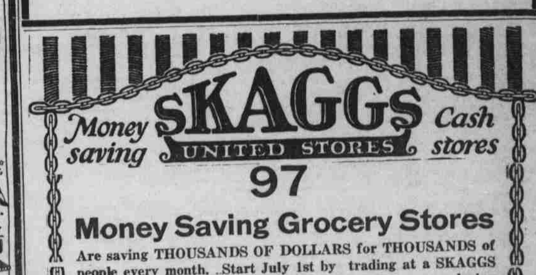
Corner State and Liberty Streets

forts of the farmers of that vicin- will be entertained at a banquet. Six schools have been conducted The road leading to the club over a period of three weeks and house also must be taken care of have had an enrollment of nearly and a water system for maintain- 600 students in the study of the LANDIS