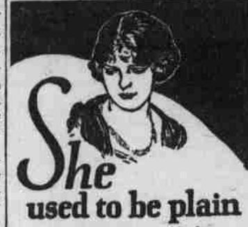
She used to be plain