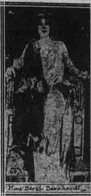
King Sarah Bernhardt

Sarah Bernhardt from her latest photograph, showing her in her most recent stage offering, "Dans la Glorie." Despite her advanced age and the loss of a leg, she is preparing for a tour of the United States and declares she will act up to the last day of her life. continued, "these stations become of increased importance. The main fleet of the navy is now stationed in the Pacific and it is necessary for its maintenance that there should be deep water bases at which it can find shelter, supply, repair and equipment." Regarding the naval aviation increases the committee said "that the absolute independence of the air service as a branch of the naval warfare" had been demonstrated. The total aviation appropriations were $14,703,000 and the report said that $15,000,000 had been appropriated for the army air service, a total for both of $29,703,000 as compared with aviation budgets of $86,424,000 by Great Britain, $44,600,000 by France and $18,723,000 by Japan.