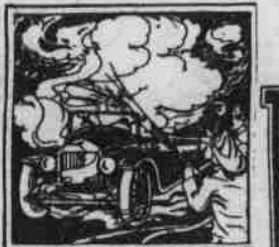
Place your insurance with an exclusive insurance office on basis of service rendered.

One day the great need in Ireland seems to be that the factions get together; the next day the only proper thing for them to do is to break away.