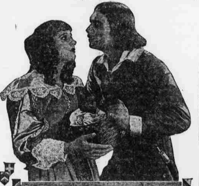
Scenes from DOUGLAS FAIRBANKS' 'THE THREE MUSKETEERS'