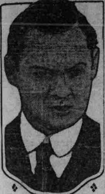
LIONEL BARRYMORE IN "JIM THE PENMAN"

In discussion the purchase of the auto camp grounds it was brought out that a sufficient response from members of clubs of the federation had been received, since the federation that the only cost of the election would be the stationery, the clubs donating