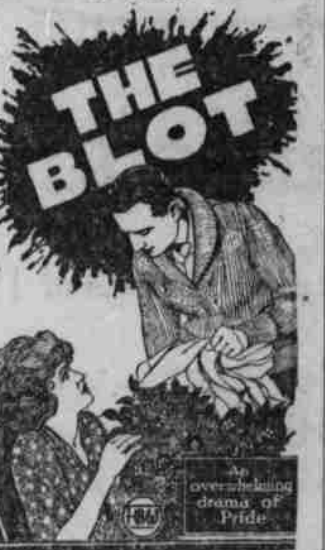
OWNERS OF THE BLIND STOMACH OF PRIDE

ancient tradition that Hachijojima is the home of sirens, for, they claim, if such is the case, why do not the sirens come to their aid, how that they are in dire need?