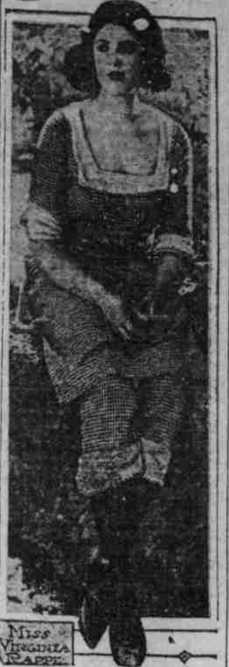
Miss Virginia Rappe, motion picture actress, who died following a "party" in Roscoe Arbuckle's suite in a San Francisco hotel. The famous comedian has been arrested on a formal complaint of murder.