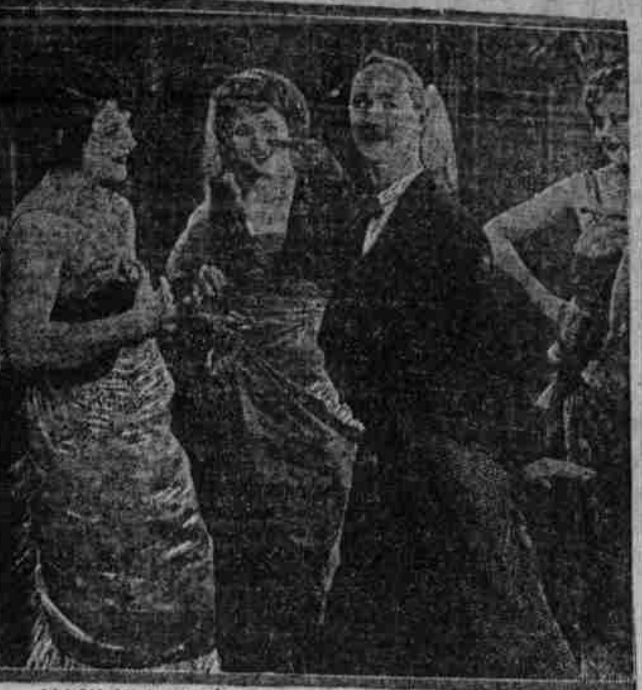
MACK SENNETT'S COMEDIANS in "HOME TALENT" Saturday and Sunday.