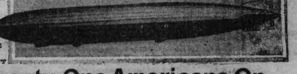
ZR-2 IN FLIGHT