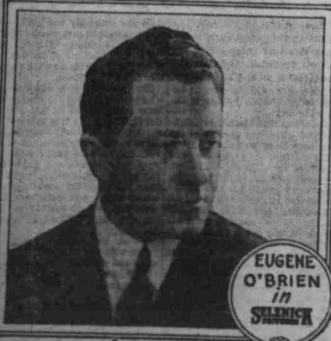
EUGENE O'BRIEN IN SILENT

Wednesday and Thursday in "Guided Lies."