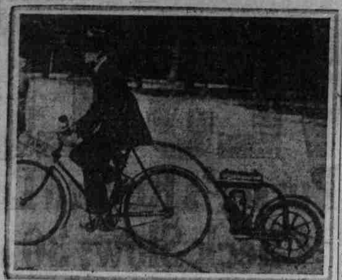
This ingenious London "Bobby" prefers the strange vehicle shown to a driver. He constructed it himself and arranged for enough seats to accommodate his whole family.