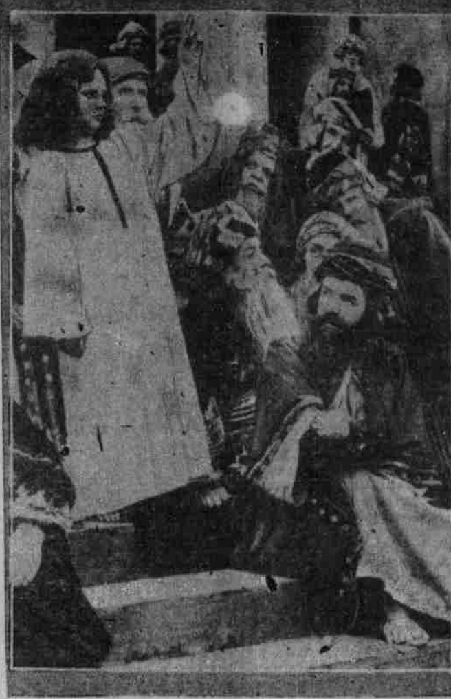
SCENE FROM "BEHOLD THE MAN"